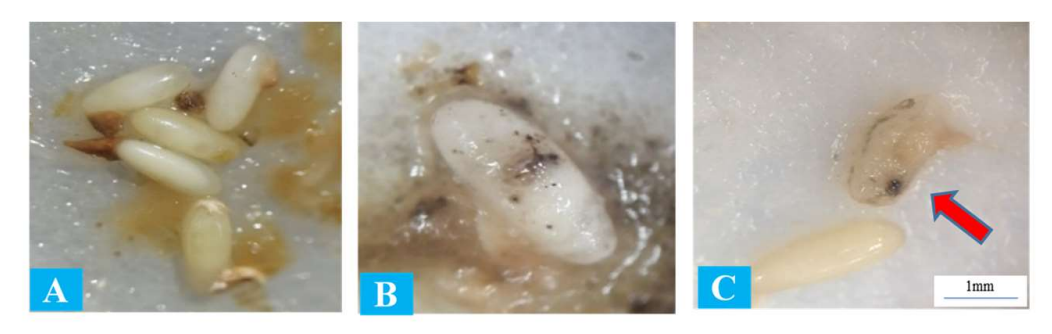
Figure 2. Comparison of red palm weevil eggs: ( A ) healthy eggs exposed to distilled water (control), ( B ) eggs infected by entomopathogenic nematodes, and ( C ) eggs damaged by nematodes. The original egg size was 3.2–3.6 mm in length. The red arrow depicts the infection spot and nematode multiplication.

As time passed following the treatment, the juveniles began to reproduce and multiply within the eggs, establishing a population. After five days, the eggs infected with juveniles were strongly damaged, whereas in the control treatment, embryonic development continued and the eggs hatched into neonates. Figure 2 shows a comparison of nematode infection and embryonic development.