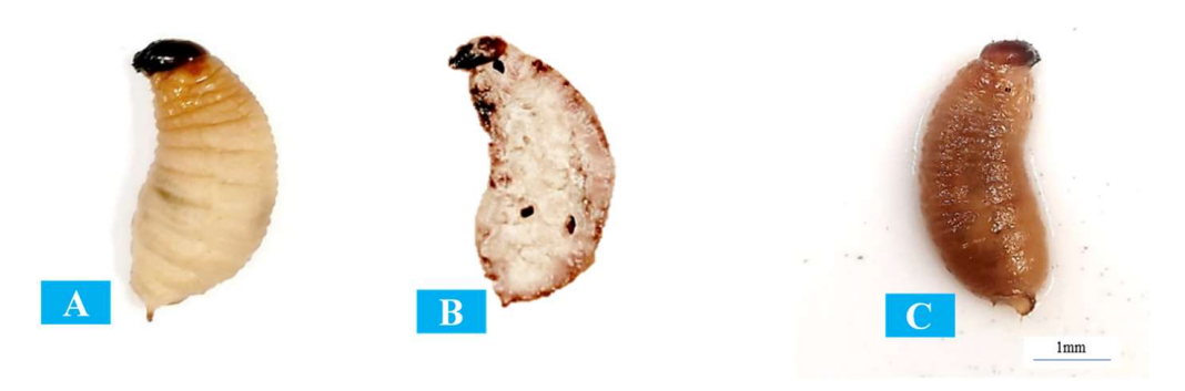
Figure 3. Comparison of red palm weevil larvae: ( A ): healthy larvae exposed to distilled water (control), ( B ) larvae infected with Steinernema carpocapsae , and ( C ) larvae infected with Heterorhabditis indica . The actual larvae size was measured as 30–35 mm in length.

The results show that all of the indigenous and commercial EPN isolates were highly effective against the RPW larvae. EPN-infective juveniles can enter the larval body by the mouth or anal opening, or they can penetrate through the cuticle and multiply inside. After seven days of inoculation, the commercial S. carpocapsae had a maximum larval mortality of 78%. Although not statistically significantly different, it demonstrated better pathogenic efficiency against the RPW larvae compared to the other two isolates. Between seven- and ten-days post-treatment, about 90% of the larvae infected with young EPNs were dead in all treatments except for the control (Table 2). These results demonstrate that both indigenous and commercial EPNs can effectively kill RPW larvae. A comparison between RPW-healthy and EPN-infected larvae is given in Figure 3.