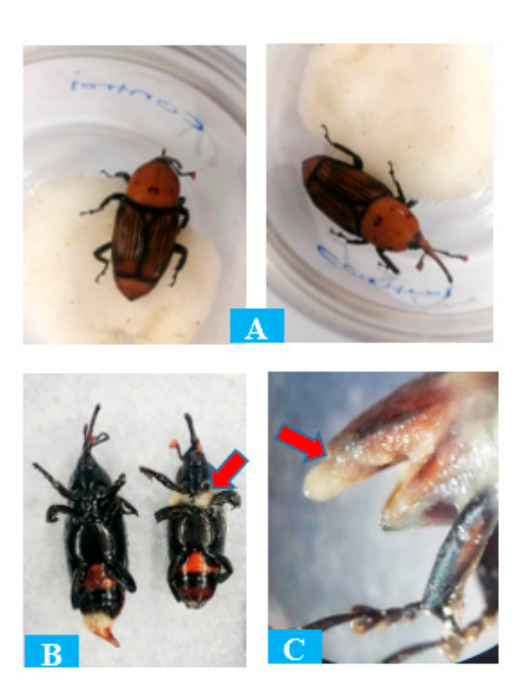
Figure 4. Comparison of healthy and nematode-treated red palm weevil adults: ( A ) healthy adult, exposed to distilled water (control), ( B ) adult infected with nematodes, and ( C ) nematode coming out of the infected adult abdomen. The red arrow depicts the infection spot and nematode multiplication.