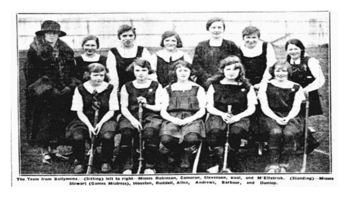
Figure 2. Northern Whig, 17 February 1925, 12.