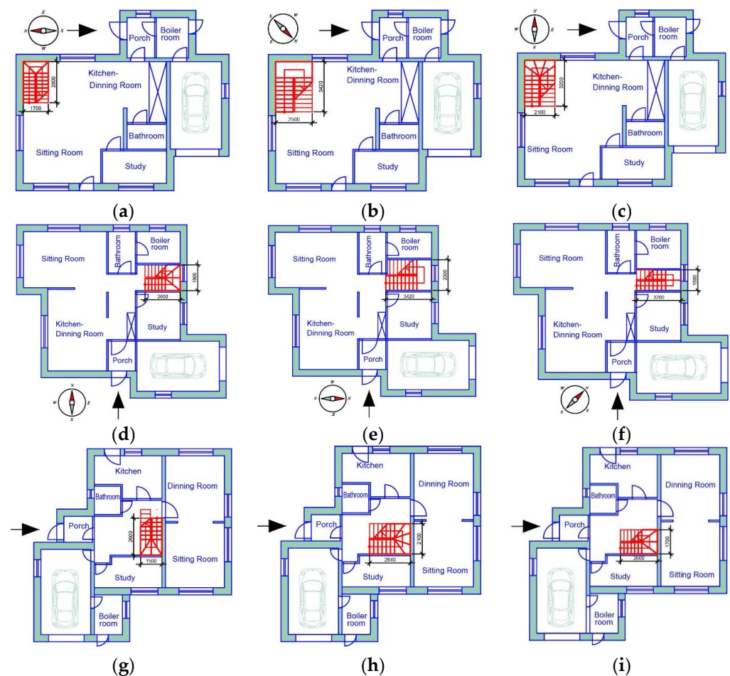
Figure 2. Staircase layout and geometric parameters according to nine schemes: (a) alternative A1, (b) alternative A2, (c) alternative A3, (d) alternative A4, (e) alternative A5, (f) alternative A6, (g) alternative A7, (h) alternative A8, (i) alternative A9.

The schemes of the alternatives that will be analysed and compared are visualised in Figure 2.