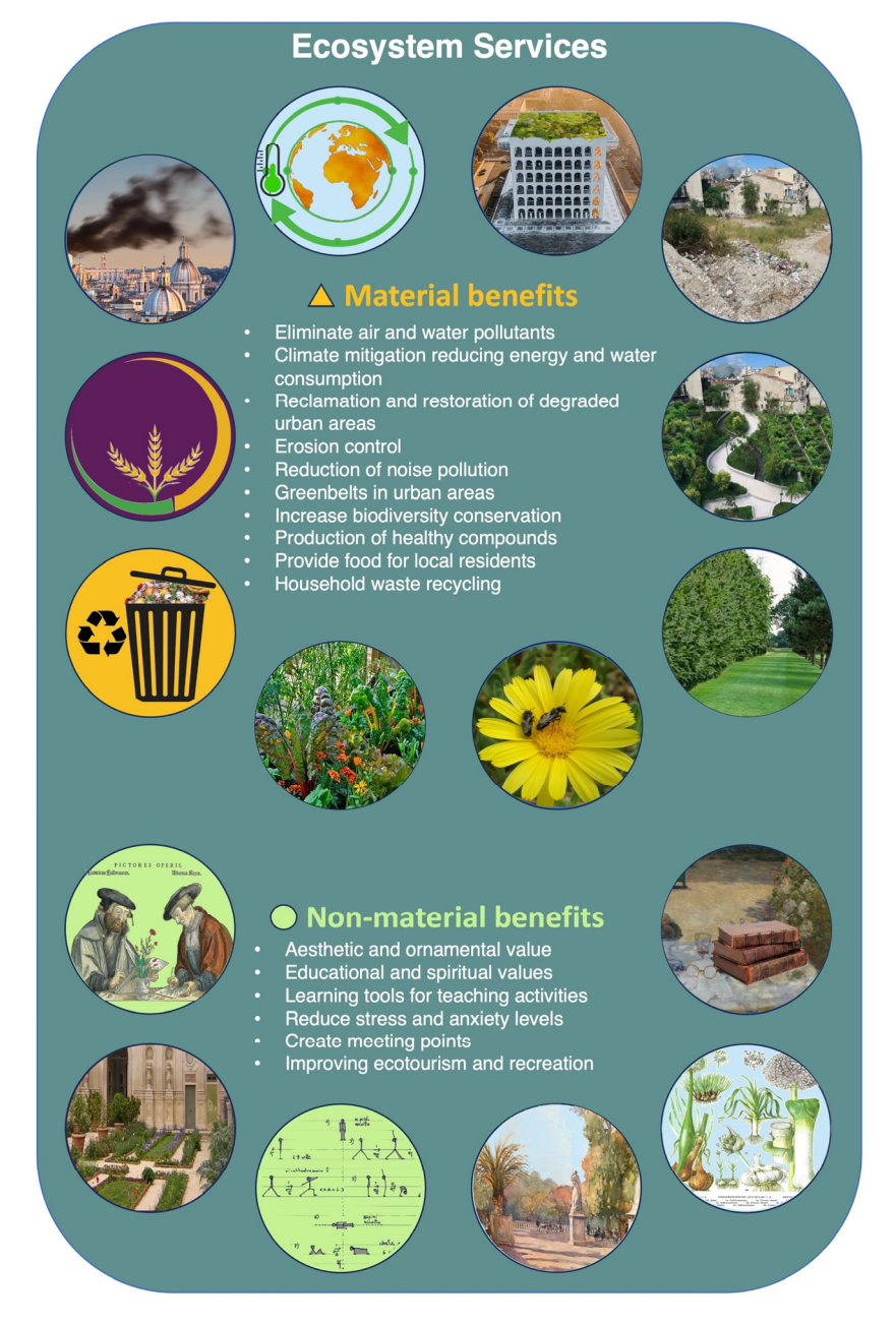
Figure 3. Ecosystem services and benefits obtained from ornamental plants in an urban and periurban area.

Ornamentals are a hugely diverse group of commercially significant plants that are grown and traded usually for decorative purposes, either as whole plants or for their parts. Among the ornamental plants, orchids have a special place due to their stunning displays of color and the shape of the flowers. Apart from their scientific fascination due to many unusual biological features, orchids account for a great part of the global floriculture trade. These are either traded as whole plants or cut flowers. Novelty is of great importance in the ornamental plant industry and many biotechnological approaches have applications in developing such novelties. In this Special Issue, such applications in two valuable orchid species of commercial importance have been described.