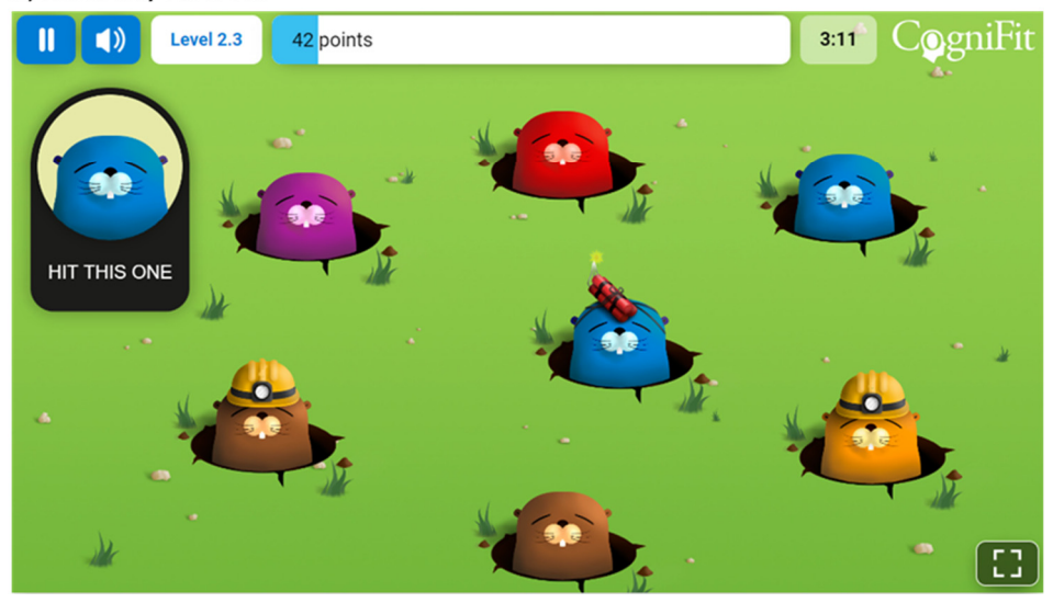
Figure 2. Example of a training activity used in the cognitive intervention (taken from CogniFit<sup>®</sup> app, version 4.4).