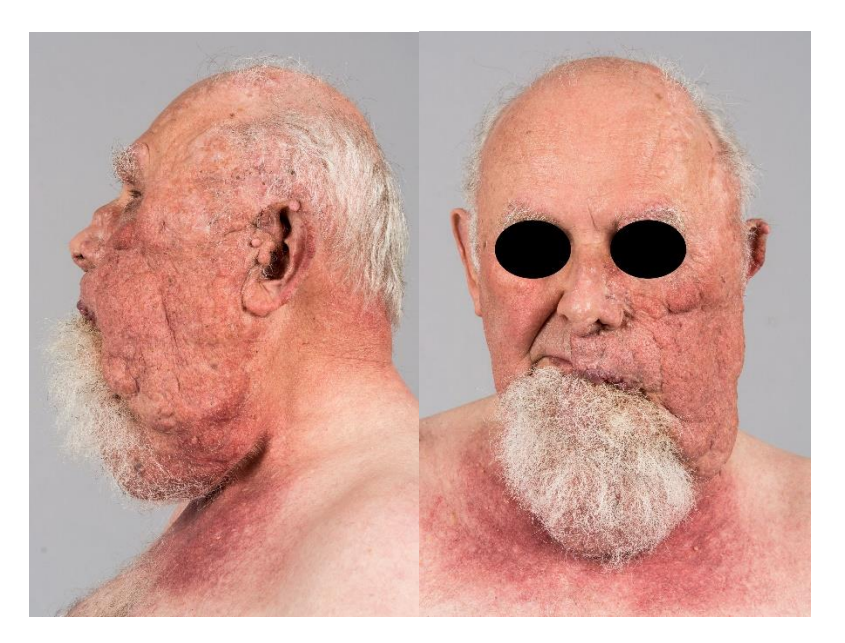
Figure 1. The skin lesion is a flesh-colored, cerebriform, nodular mass, 26.0 \times 11.0 cm, on the left side of the face. The smooth surface showed up papillomatous with enlarged follicle-like pores and a waxy discharge. The neck showed a pendolous, dewlap-like mass.

On examination, the skin lesion—surrounding the entire left side of the face (Figure 1), parts of the head, ear, and neck—presented as a flesh-colored, partially erythematous-livid, cerebriform, nodular mass with blurred borders to the adjacent healthy skin and reached approximately 26.0 \times 11.0 cm in size. The left half of the neck showed a pendulous, dewlap-like mass. The surface appeared papillomatous with enlarged follicle-like pores. Due to the constant growth of the skin lesion, the patient underwent two cosmetic surgeries in 1991 and 1992, as the weight affected the left eyelid and pulled it downwards. In addition, the patient reported wax-like secretions that could be expressed from the umbilicated center of the papules. He has been taking Isotretinoin in different dosages since 1993.