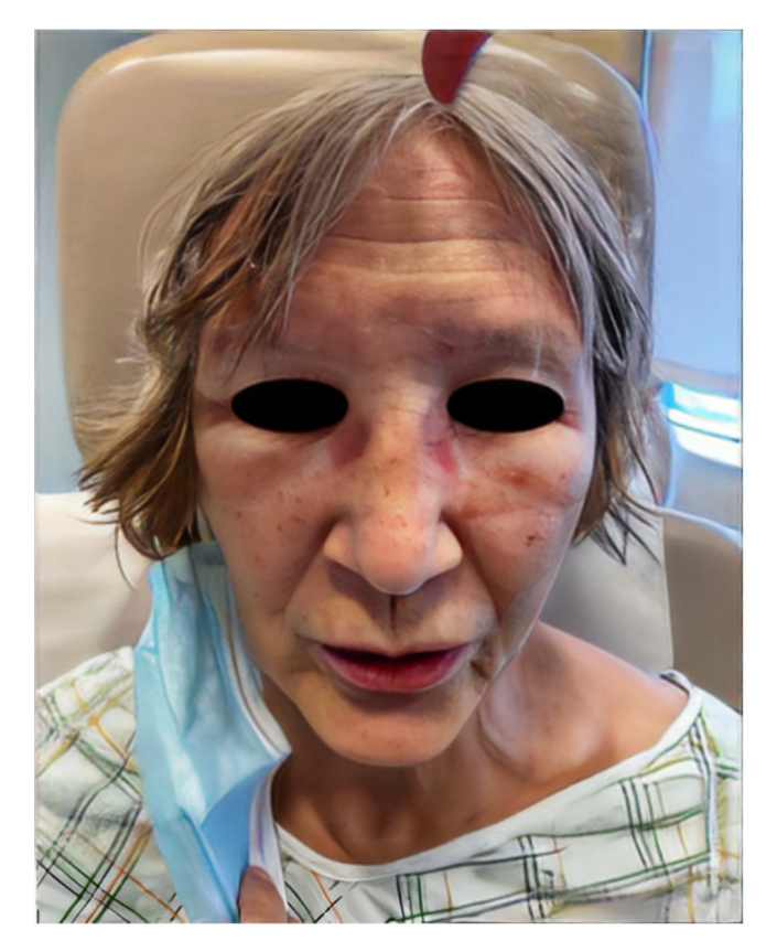
Figure 2. Facial edema. Facial swelling especially prominent around the eyes.

Figure 1. Shawl sign. Red violaceous poikilodermatous plaque with mottled hyperpigmentation and hypopigmentation along with areas of atrophy over the upper chest.