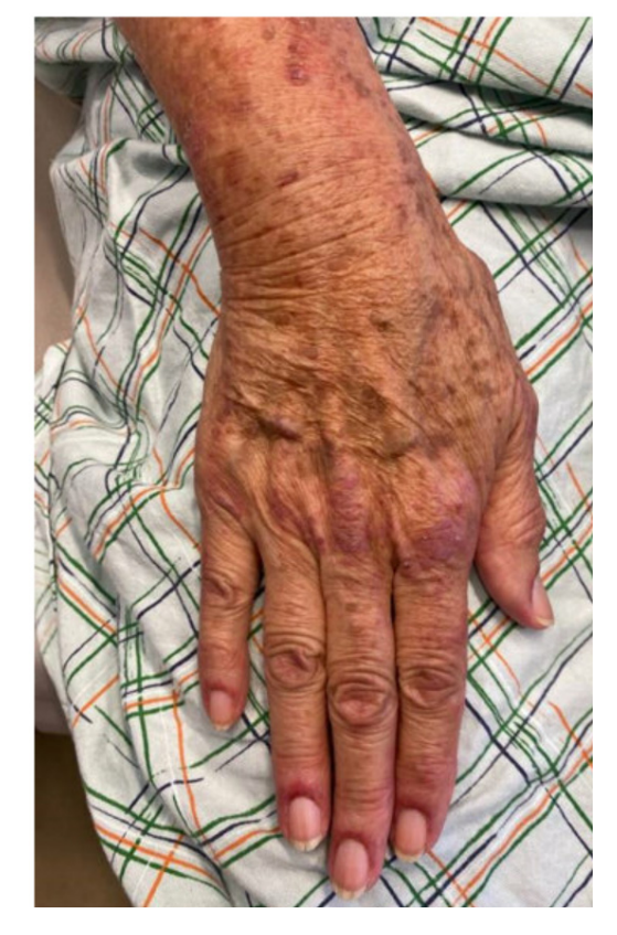
Figure 3. Gottron papules. Violaceous papules and plaques over metacarpophalangeal joints and around fingernails. Also noticeable is mild hand edema and edema in the wrist.

along with ordering CBC, CMP, ANA, ENA, CK, Aldolase, and a myositis panel. The patient was prescribed 60 mg prednisone daily for three weeks, which eliminated her facial swelling and ameliorated her erythematous rash. Additional workup included hepatitis serologies and HIV and tuberculosis screening to prepare for steroid-sparing immunosuppressive treatment. CA-125, CT abdomen pelvis, DEXA scan, mammogram, and PFTs were also ordered, and prophylactic treatment was started with Bactrim, calcium, and vitamin D.